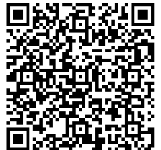
Assessing Meaningful Community Engagement: A Conceptual Model to Advance Health Equity through Transformed Systems for Health. Nam Perspectives . 2022;22(2). doi:10.31478/202202c